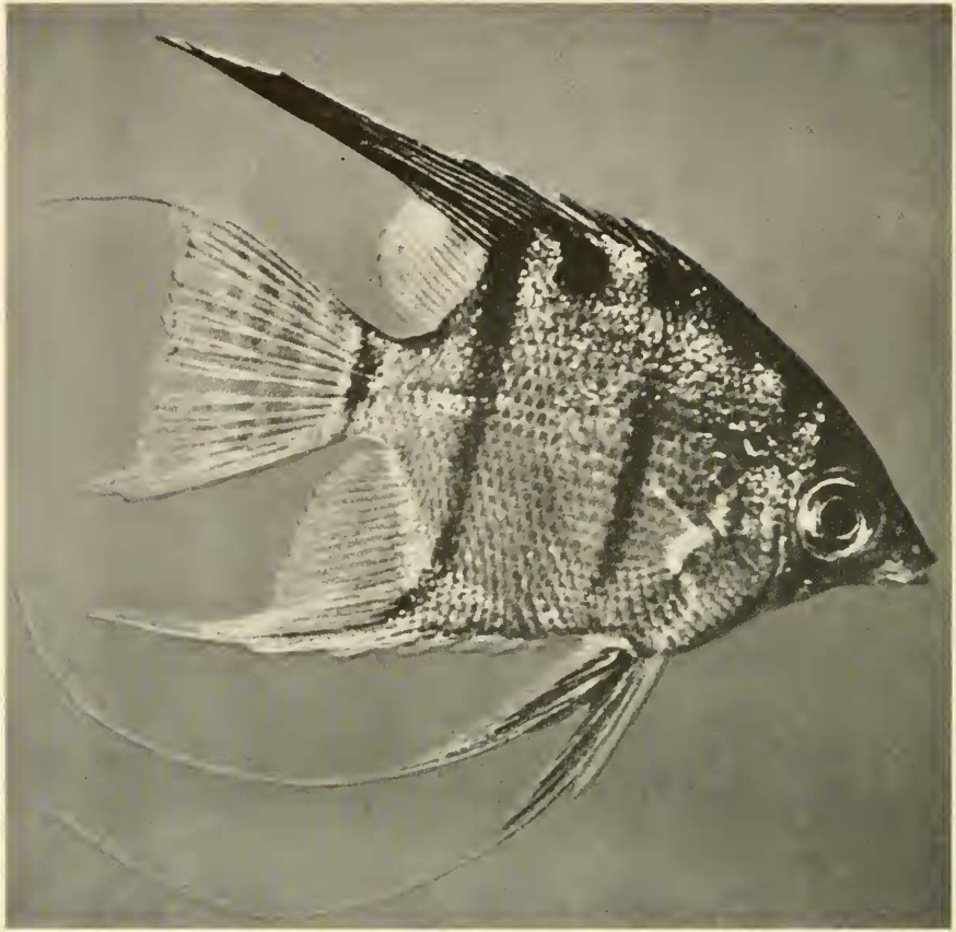
Pterophyllum dumerilii (Castelnau).